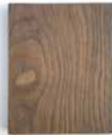
Weathered Gray Oak