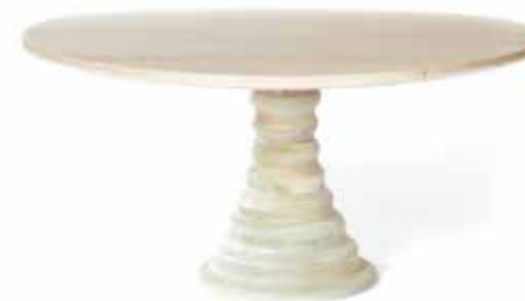
Antique White Finish Sample