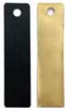
Black and Brass