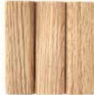
Fluted Natural Oak