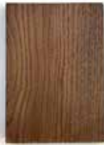
Dark English Oak