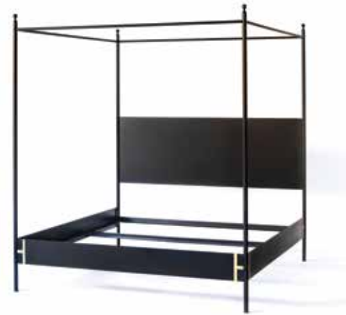
Black and Brass Finish Sample