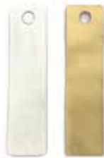
White and Brass